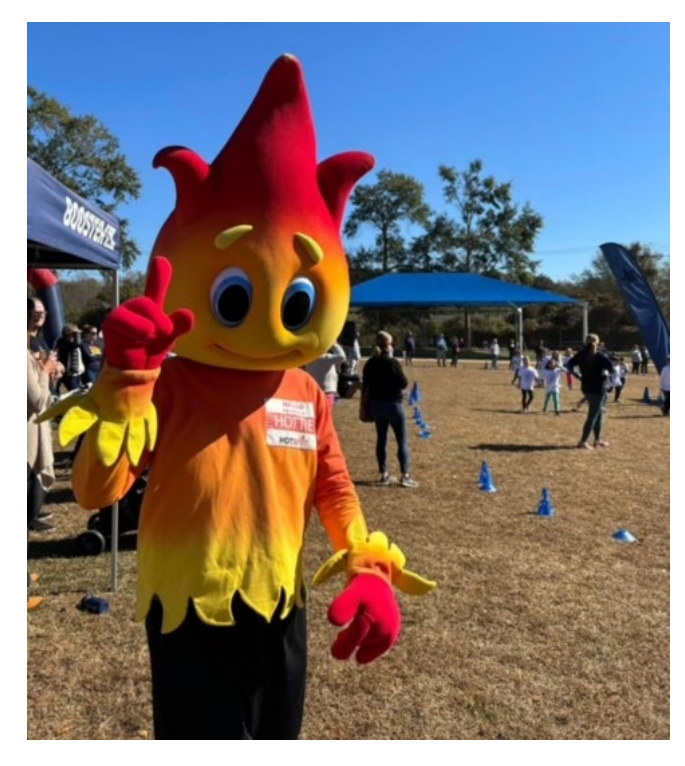
Great day at the Jesse Boyd Elementary Fun Run! Happy to sponsor the active youth and our local schools!